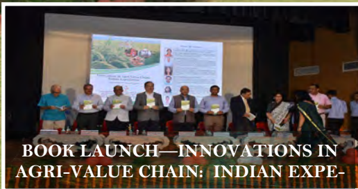
BOOK LAUNCH—INNOVATIONS IN AGRI-VALUE CHAIN: INDIAN EXPE-