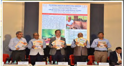
LAUNCHING OF CCS NIAM POSTCARD