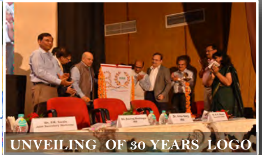
UNVEILING OF 30 YEARS LOGO