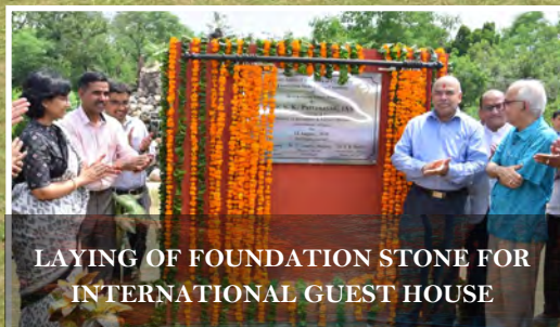
LAYING OF FOUNDATION STONE FOR INTERNATIONAL GUEST HOUSE

FARM TO FORK IS AN INITIATIVE OF PGDM (ABM), CCS NIAM