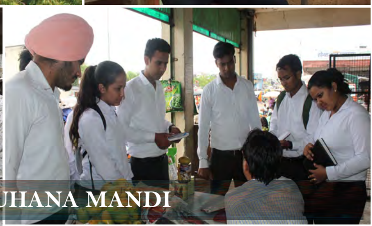
VISIT TO MUHANA MANDI