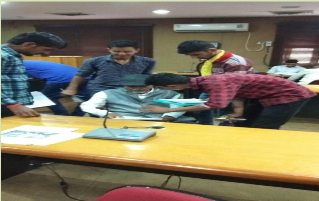
Participants are deeply involved in group exercise with instructor