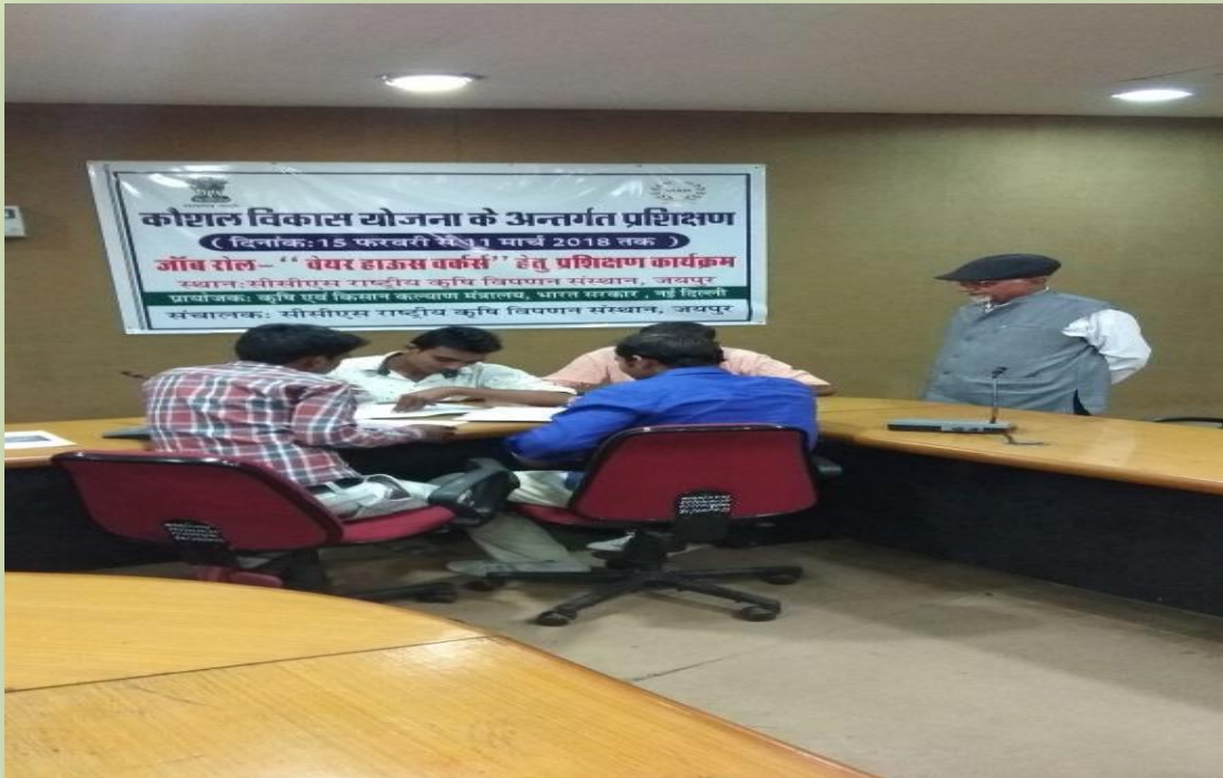
Involved in group exercise with instructor