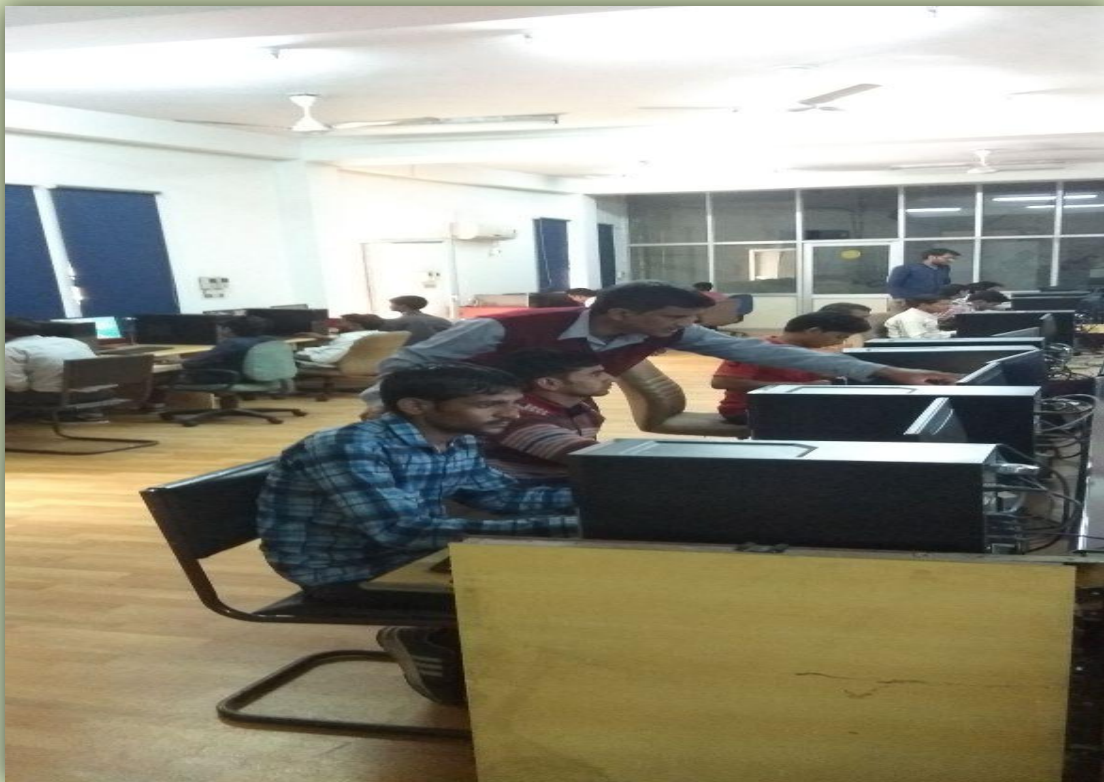
Exposure of computer knowledge to the participants by the IT Facilitator