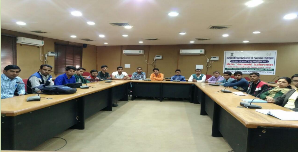
Introduction with the participants in classroom