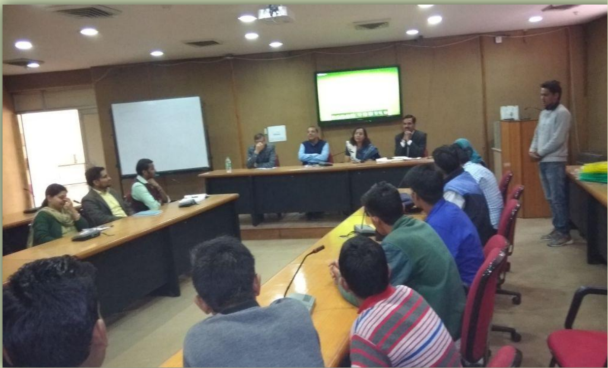
Inaugural function of first training program for the Job Role of “Warehouse Workers”

First training program under Skill Development Scheme for the Job Role of “Warehouse Workers” is in progress. The duration of program is 25 days (200 hrs.) from 15.02.2018 to 11.03.2018. Total 20 participants from rural background of various districts of Rajasthan are enrolled in the first program. The glimpses of photographs are as under: